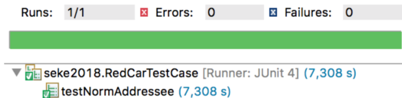
Figure 4. The result of test casse execution

Figure 4 depicts the result of the test case execution visualized in a JUnit style.